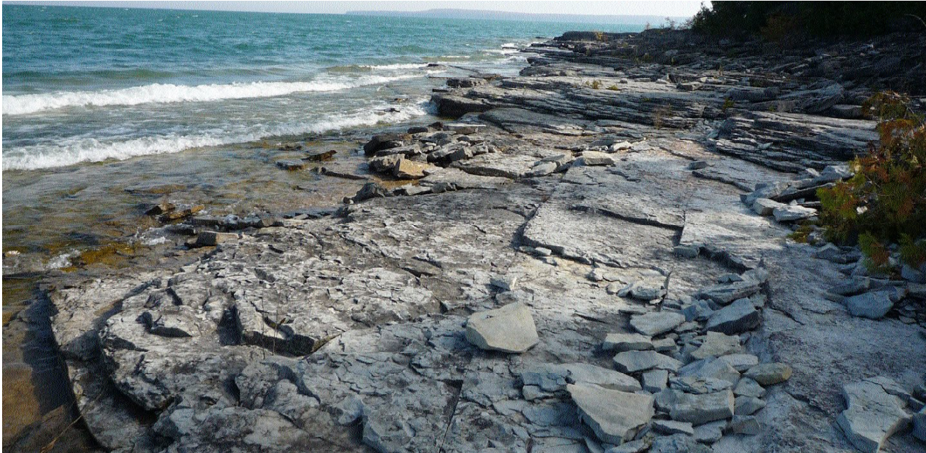
St. Joseph Island pipestone source.