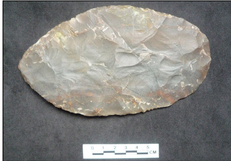
Gordon Lake chert biface