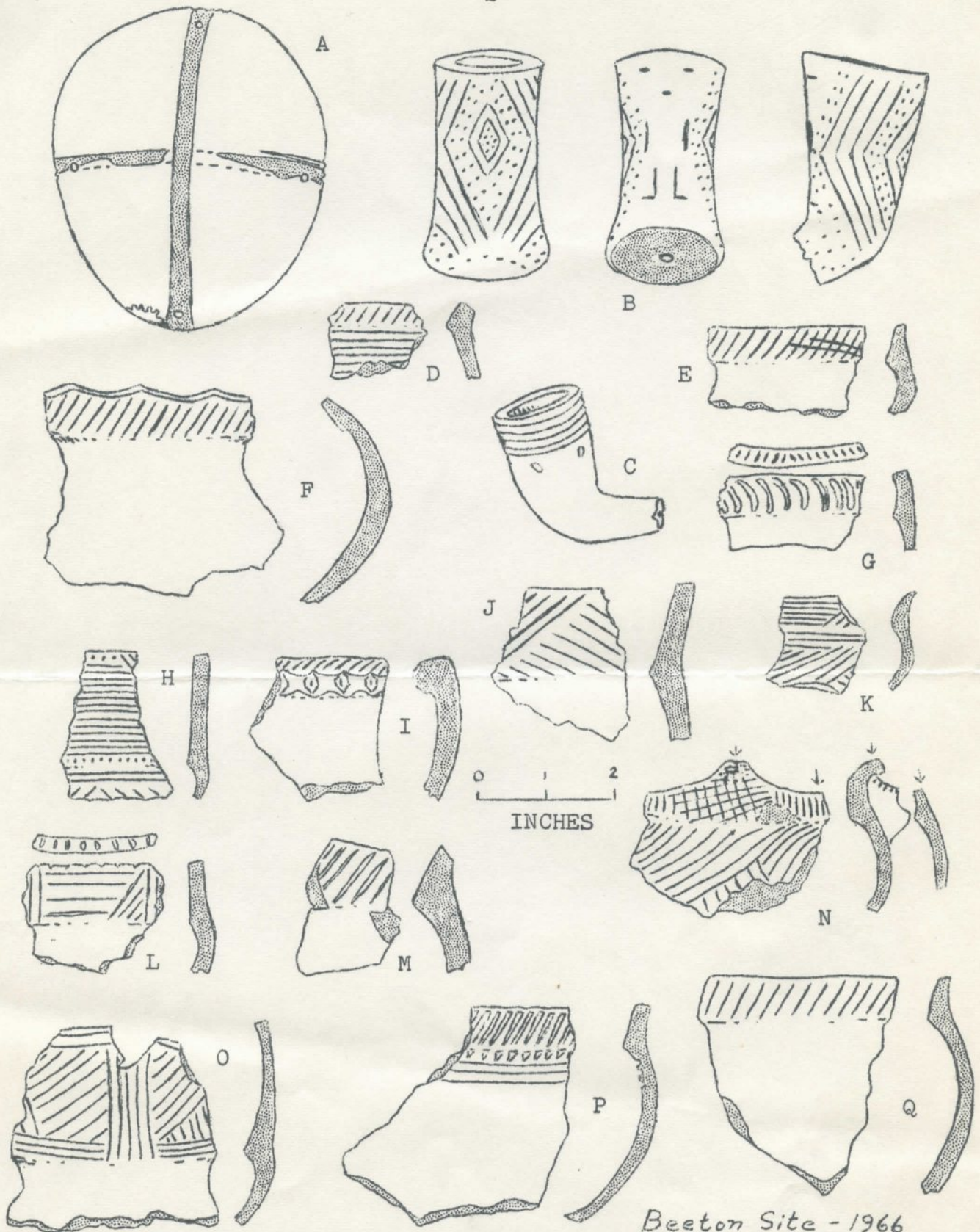
Figure A. Painted human skull gorget or rattle. Figures B,C. Clay pipes. Figures D to Q. Pottery rim sherds.