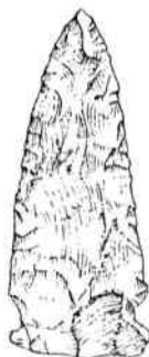
Illustration by A. Stewart, Royal Ontario Museum

Jackson, L.J., 1980. "Dawson Creek: An Early Woodland Site In South-Central Ontario." Ontario Archaeology , No. 33, pp. 13-32.