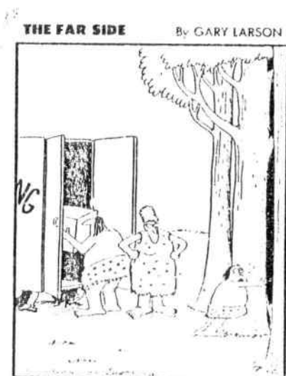
Primitive Man leaves the trees