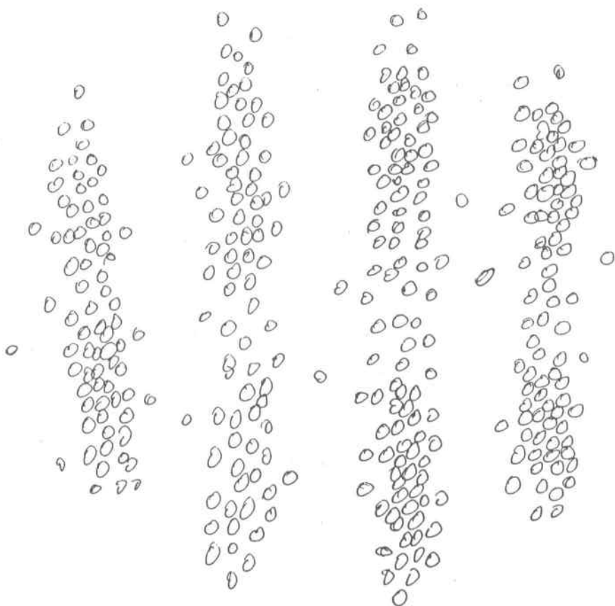
Figure 3: Linear Rows of Posts.