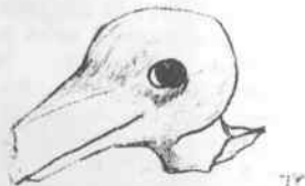
Possible raven effigy from smoking pipe found at the Otstungo Site in the Mohawk Valley (cat.# TU 9/1). Drawn by Todd Preston.

The manufacture and significance of ceramic smoking pipes among Northern Iroquoian groups has been a topic of considerable attention (Kuhn 1985, Noble 1979, Mathews 1976, Wray 1956). Many agree that men were for the most part the makers and users of pipes (Kuhn 1985:69-77), (Woolfrey et al. 1976:7). Men also dealt with warfare as a primary activity and concern (Fenton 1978:315). The significance of effigy pipes has been linked to various aspects of Iroquois ideology (Kuhn 1985:98-101). In general, animals and birds depicted on the pipes qualify as representations of supernatural themes and pipes were probably sacred (Mathews 1980:303-304). The association of pipes with men, and the general ideological significance of pipes suggests the possibility of a strong link between pipes and ideology surrounding warfare.