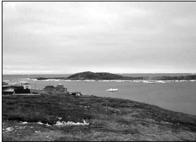
Fig. 4: View of Saddle Island and Red Bay from interpretive centre lookout.

Day 3 dawned and we had a relaxed schedule of 10 a.m. departure. Several of us walked around the working harbour of the town while others made for