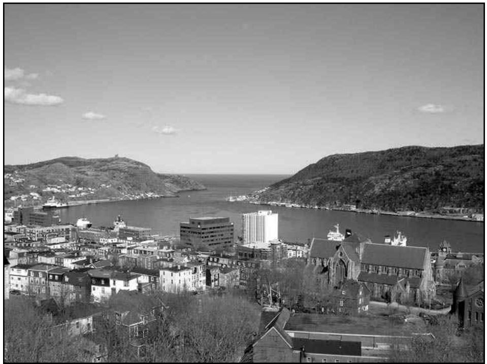
Fig. 1: View of the Narrows from The Rooms, St. John's.

To be honest May is not the best time to make this trip or to visit these sites as the weather was not the best. The biggest drawback for a visit in May is that none of the sites were officially open, although because of Tuck all the sites were opened for us. Most