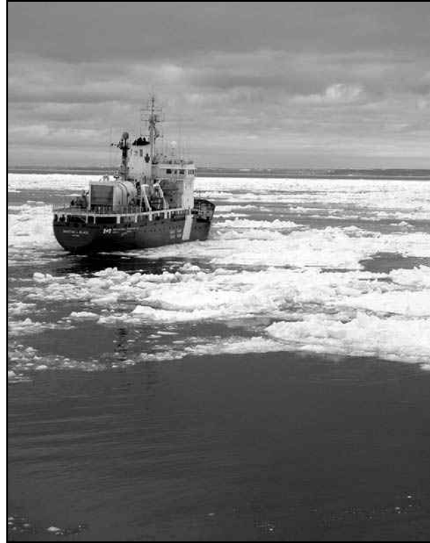
Fig. 3: The Martha L. Black leads the way through the icepack.

An hour or so out of Deer Lake (which is named for caribou, not deer of which there are none on the