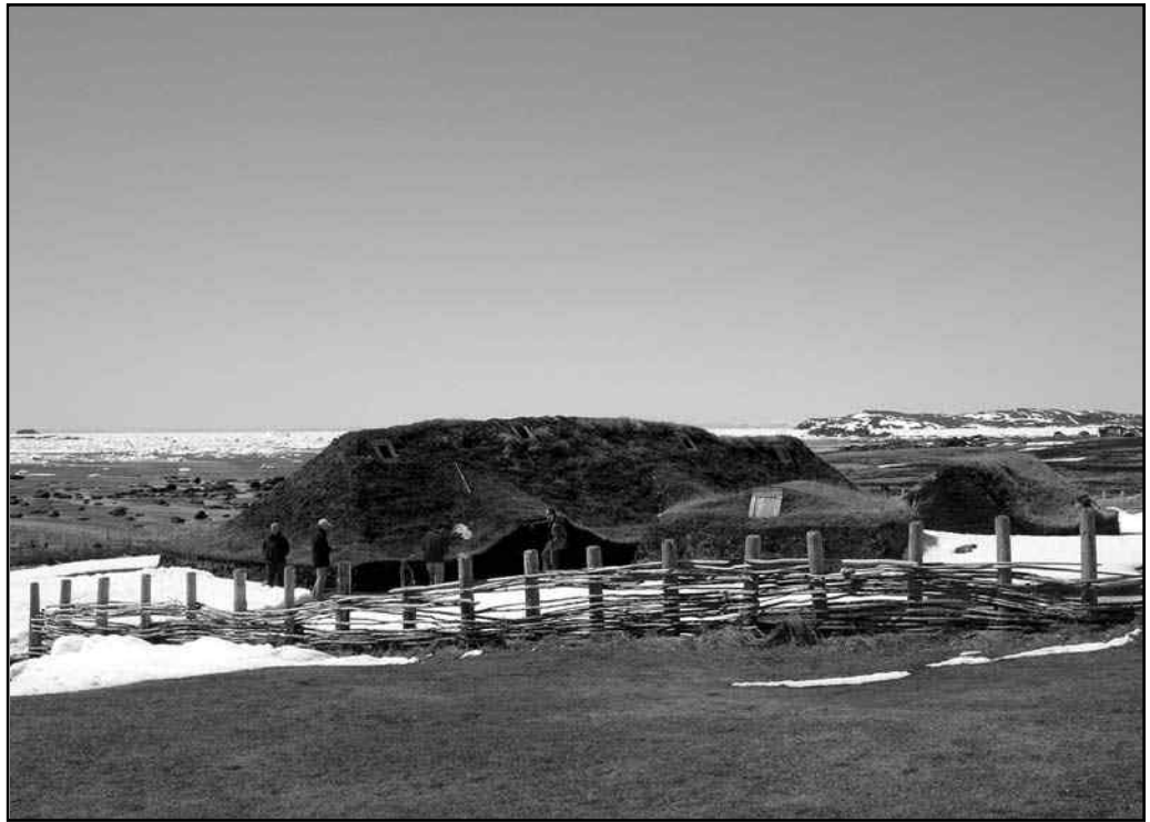
Fig. 6: The reconstructed house at L'Anse Au Meadows with the ice-filled cove in the distance.

This was a whirlwind tour as most of us didn't have a lot of time to travel because we had already been in Newfoundland at the CAA conference the previous week. So when you go, plan to spend at least a week or longer travelling around. The historic and archaeological sites are well signed and the interpretive cen-