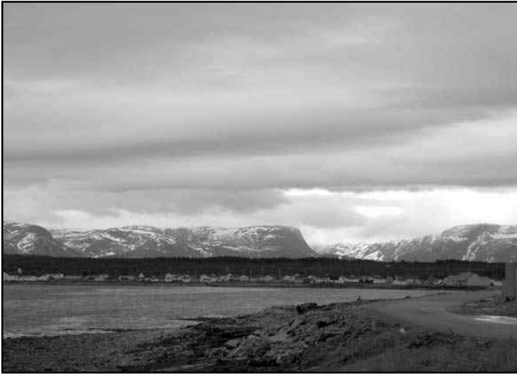
Fig. 2: Gros Morne Mountains in the distance, view from Cow Head cove.

sites open in June. Even in June there are no guarantees that the weather will be warm and sunny.