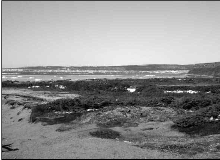
Fig 5.: The reconstructed L'Anse Amour burial mound is the rock covered mound in the foreground of this photo. The ice filled cove is in the distance.

not small floes, loomed all around us as the Canadian Coast Guard ice-breaker the Martha L. Black picked its way slowly through the pack ice (Figure 3). The Apollo followed gingerly tapping floes as she moved through the water. A boat really does shudder when it hits a massive ice floe; we all had thoughts of the Titanic. The crossing, covering about 9 miles, took an hour and a half, depositing us in Blanc-Sablon, Quebec.