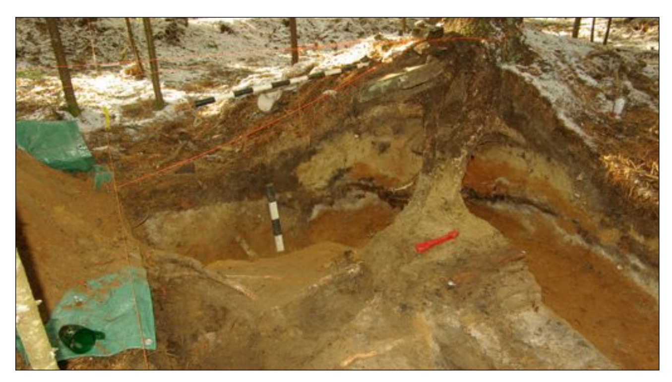
Fig.4: SE quadrant of camboose. Archaeologists see stratigraphy; non-archaeologists see a face

western foundation mound is very close to a river meander, which will eventually erode the site completely. Additional