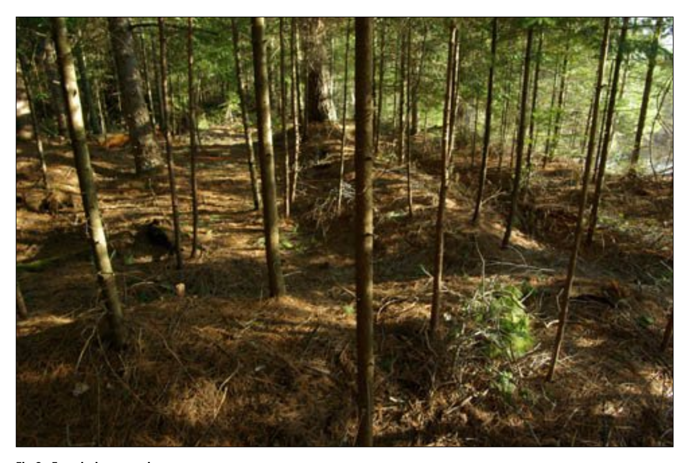
Fig.2: Foundation mounds

site suggests it may have escaped such interference.