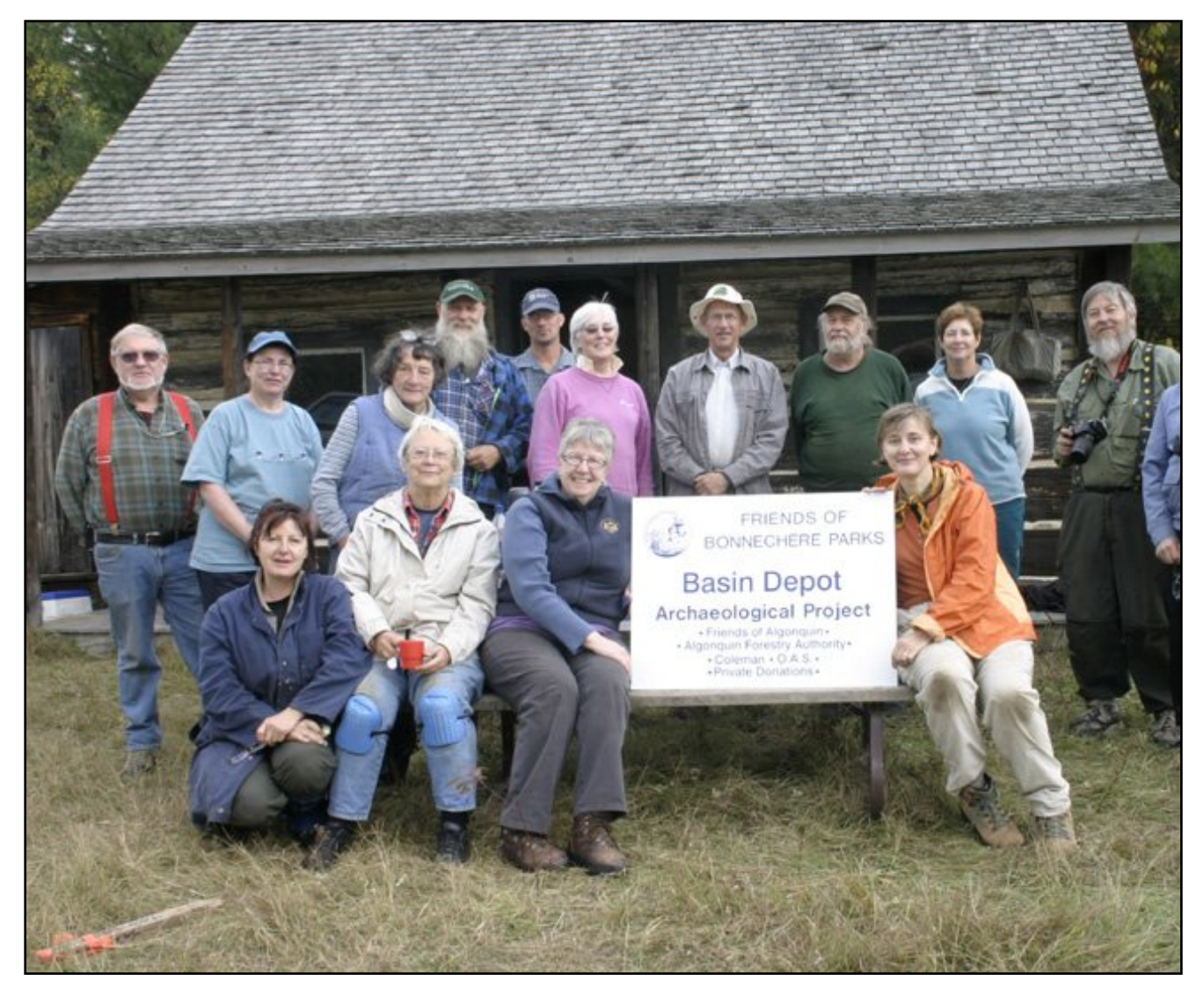
OAS Ottawa Chapter's 'Return to Homeland Committee'