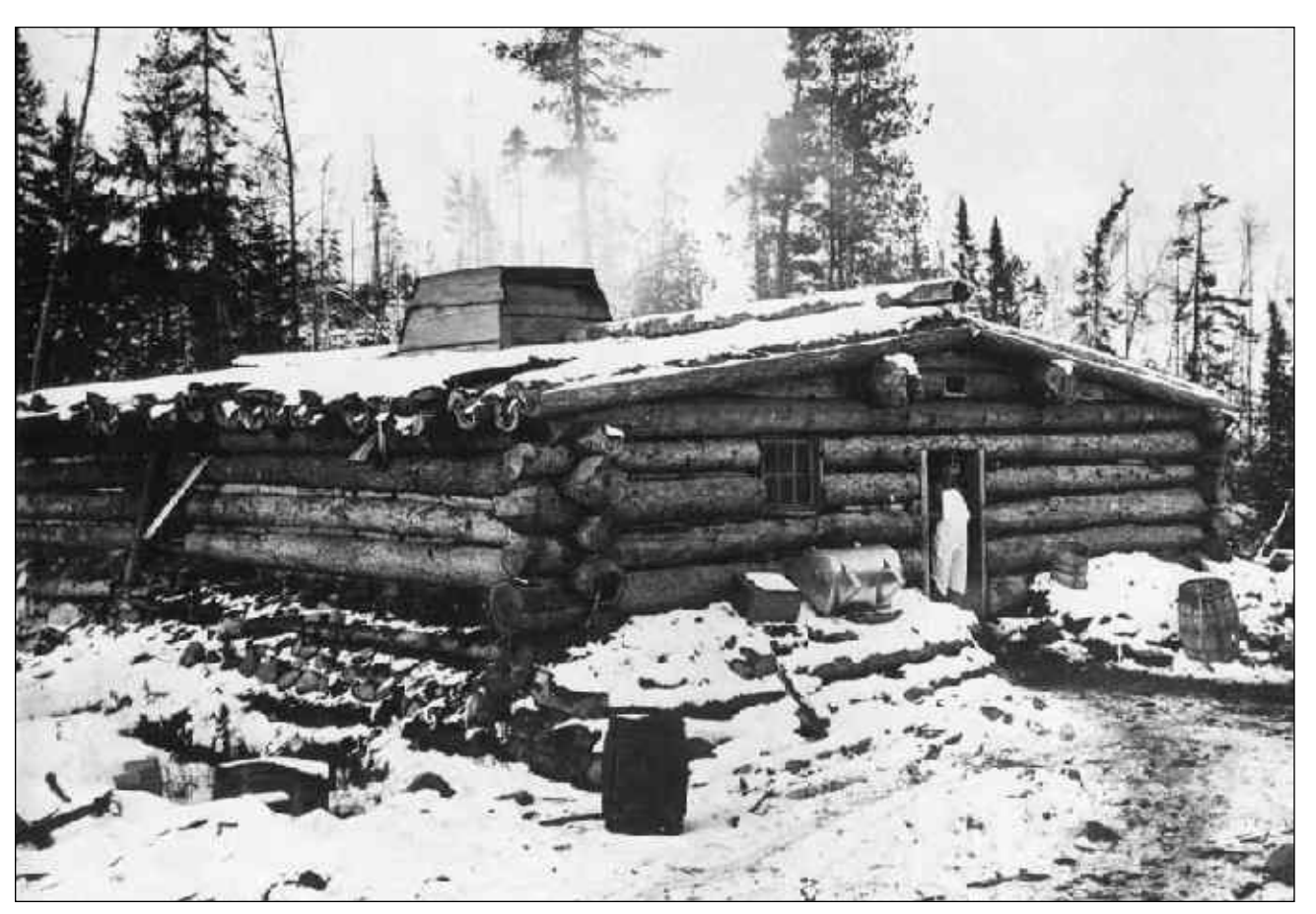
Fig. 1: Camboose shanty