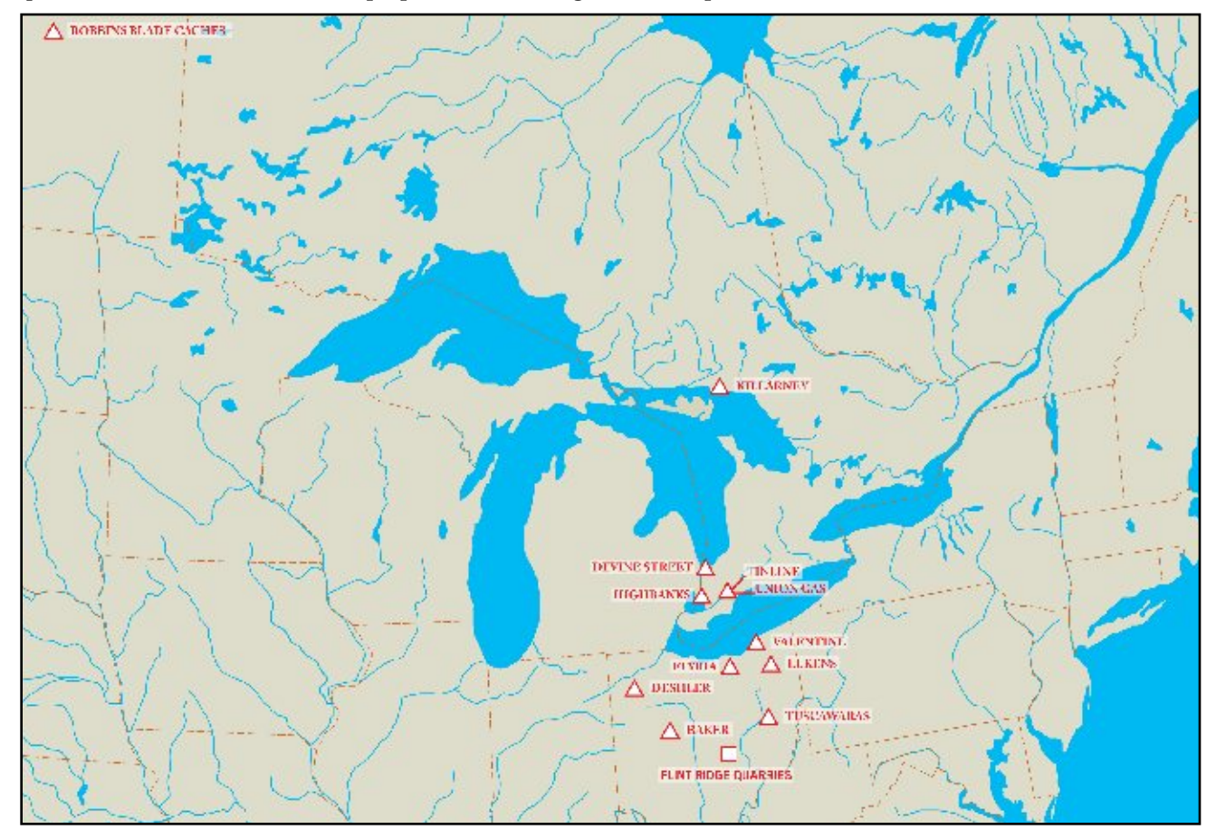
Figure 8: Distribution of Robbins Blade Caches

So what does all this mean? To begin with, a review of the geographic distribution of these assemblages, as opposed to the Vanport chert Robbins blade caches which I discuss