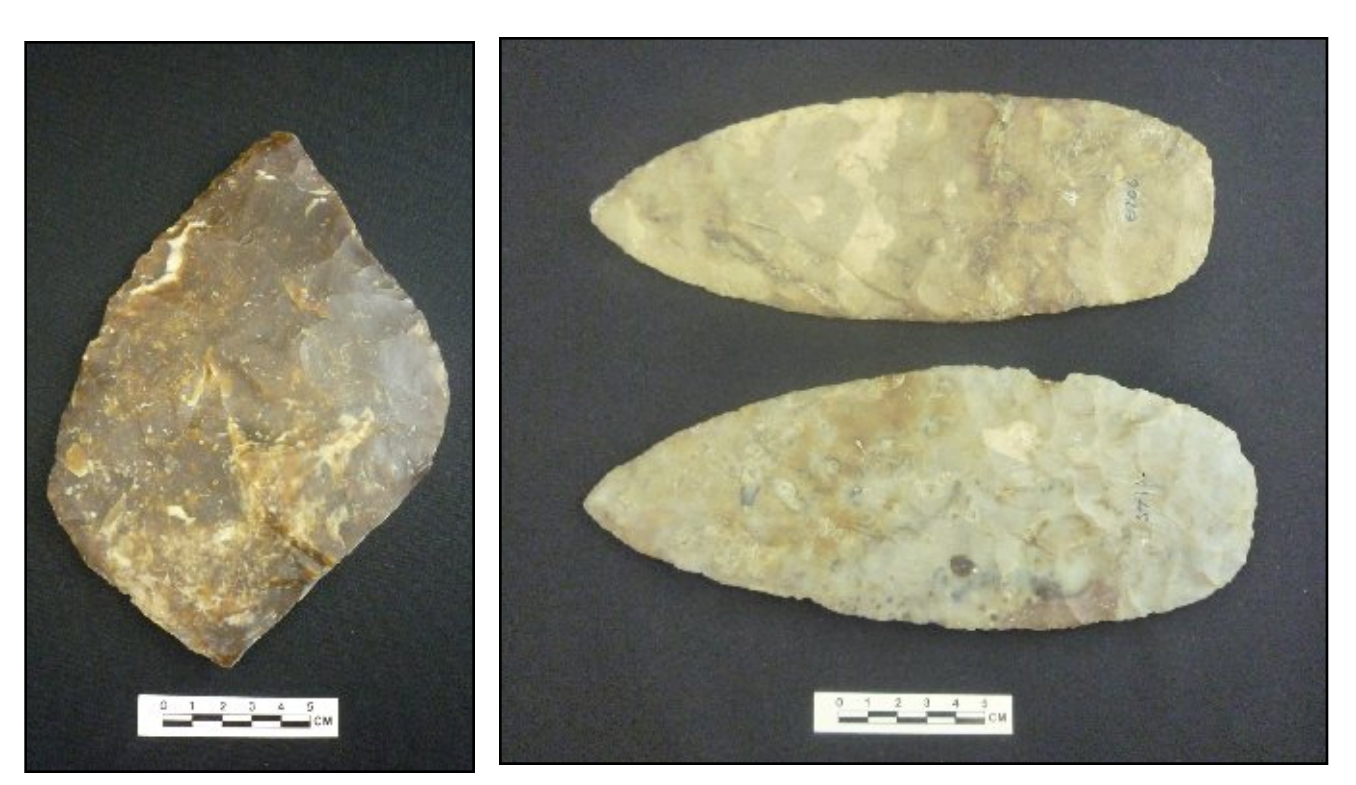
Figure 4: two Vanport Chert Bifaces from Tidd's Island