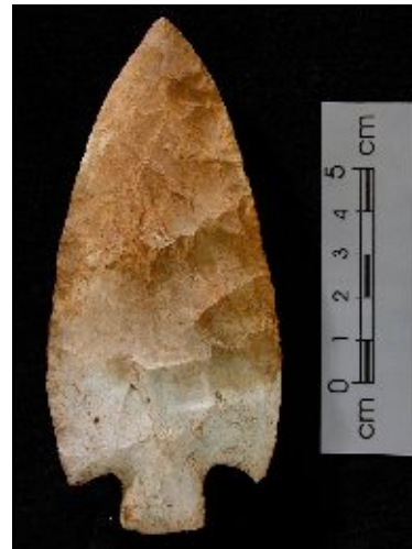
Figure 6: Morrison Island 2, Mercer Chert Little Bear Creek Biface

central Ohio and Muldraugh chert from southern Indiana.