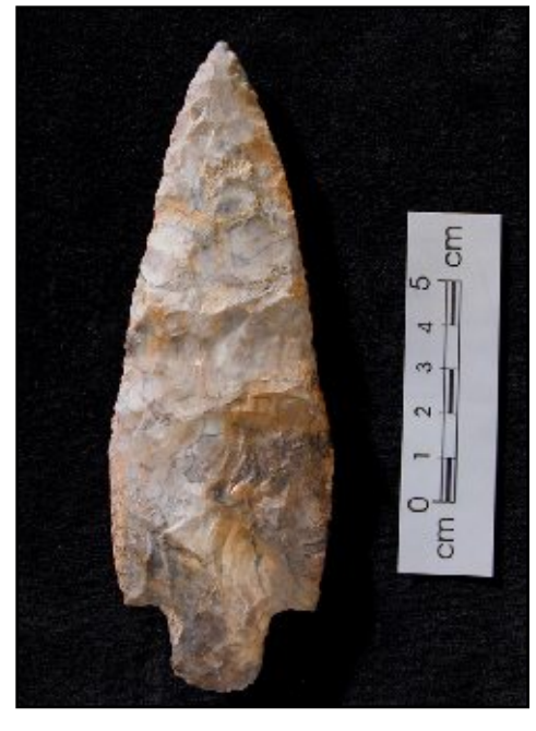
(Left) Figure 5: Morrison Island 2, Burlington Chert Snyder Biface