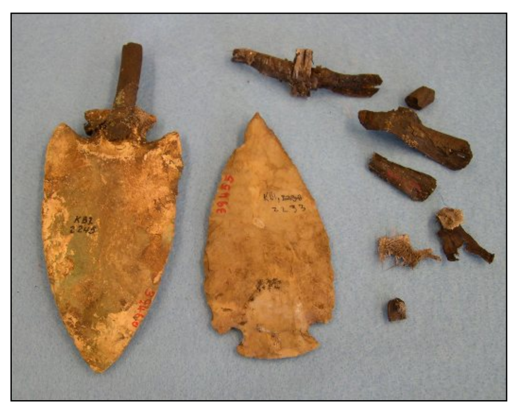
Figure 10: Killarney Bay I Hafted Snyders Bifaces

transportation routes, consistent with the Middlesex Complex and within historically documented Algonquian (albeit Central Algonquian) territory (Figure 8).