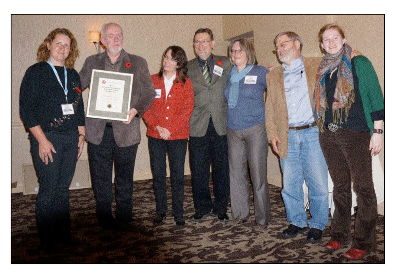
Staff from Archaeological Services Inc. take a bow after being presented with the Award of Excellence in Cultural Resource Management