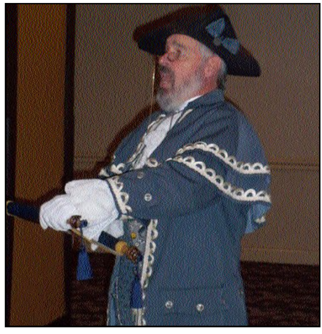
The Windsor Town Crier welcomes guests to the 2012 Symposium banquet

Award recipients were recognized for meritorious service to the OAS, some over many decades. J. Norman Emerson Awards were