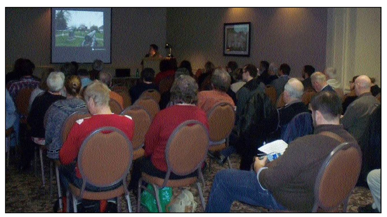
Surprisingly, with so much going on at the symposium, people still found time to attend papers.