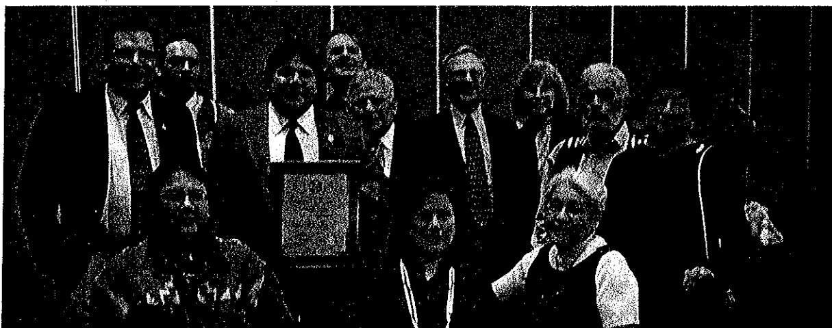
Representatives of the Blue Water Bridge Authority and the Aamjiwnaang First Nation at the 2001 Heritage Conservation Award Presentation

At the banquet held during the recent Hamilton symposium, the 2001 Heritage Conservation Award of The Ontario Archaeological Society Inc. was presented jointly to the Blue Water Bridge Authority and to the Aamjiwnaang First Nation in recognition of their combined efforts and accomplishments concerning the multiple year archaeological investigations conducted on the Blue Water Bridge Authority property. These archaeological assessments and mitigative excavations have added significantly to the knowledge gained from a long series of studies, beginning in 1993, conducted in the Village of Point Edward, Ontario on behalf of the Blue Water Bridge Authority and in consultation with the Aamjiwnaang First Nation. They have demonstrated that Aboriginal peoples established a series of overlapping warm-weather campsites and special activity areas that date from at least the Middle Archaic period (circa 3500 B.C.) to the Late Woodland period (circa A.D. 1500). Aamjiwnaang oral traditions indicate that the occupation of the lands extended even later into the 1500s, and ringed the shoreline of the St. Clair River and the former Sarnia Bay.