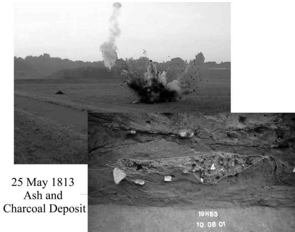
Figure 2. The American artillery bombardment of Fort George, Niagara-on-the-Lake, on 25 May, 1813, reduced the work to a smouldering ruin. Tangible remnants of this event are marked on the site's archaeology—even at considerable distances from the historic buildings—in the form of an ash and charcoal deposit.

By placing interpretation so prominently, we override the problem noted in the 1980s by DUA archaeologists, who found that the absence of preliminary interpretation in their field forms produced only a vague record of what had been