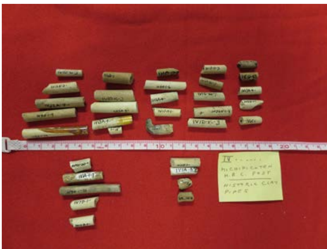
Clay pipe stems from Michipicoten HBCo site

The boxes include a very diverse collection of items with no catalogue or inventory for reference other than a list identifying the Borden number and a general description of the item. The integrity of the objects seems to be well preserved, and great care was taken in storing and carefully packaging the artifacts. The boxes contain anything and everything. The list so far includes bottles, buttons, bones, stones, clay pipe bowls and stems, ceramics, china, leather, iron, axe heads, nails, glass, bricks ... and the odd mystery item!