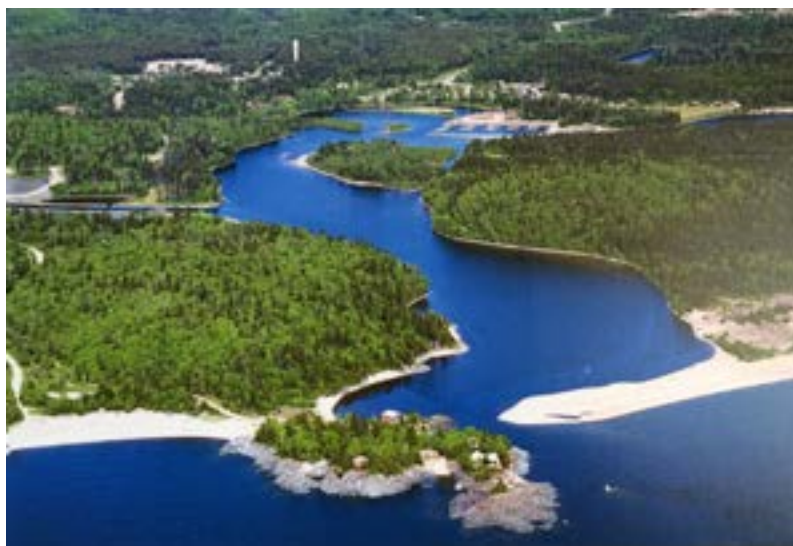
Aerial view of Michipicoten River mouth

The land near the mouth of the Michipicoten River today is no longer inhabited by the Michipicoten Ojibway. The landscape now shares relationships with a number of public and private corporations, each with a stake in the management and future vision of the area. The north and east banks of the river fall within the boundaries of the Municipality of Wawa, including a municipal marina and the small suburb of Wawa known as Michipicoten River Village. The south bank of the river is part of Michipicoten Post Provincial Park. Established by the Province of Ontario in the early 1980s, it was created to protect the unique natural and cultural heritage of the mile-long beach, which includes a number of indigenous settlement sites (one dating back 900 years), as well as the Michipicoten fur trade post location and adjacent cemetery dating back to 1725.