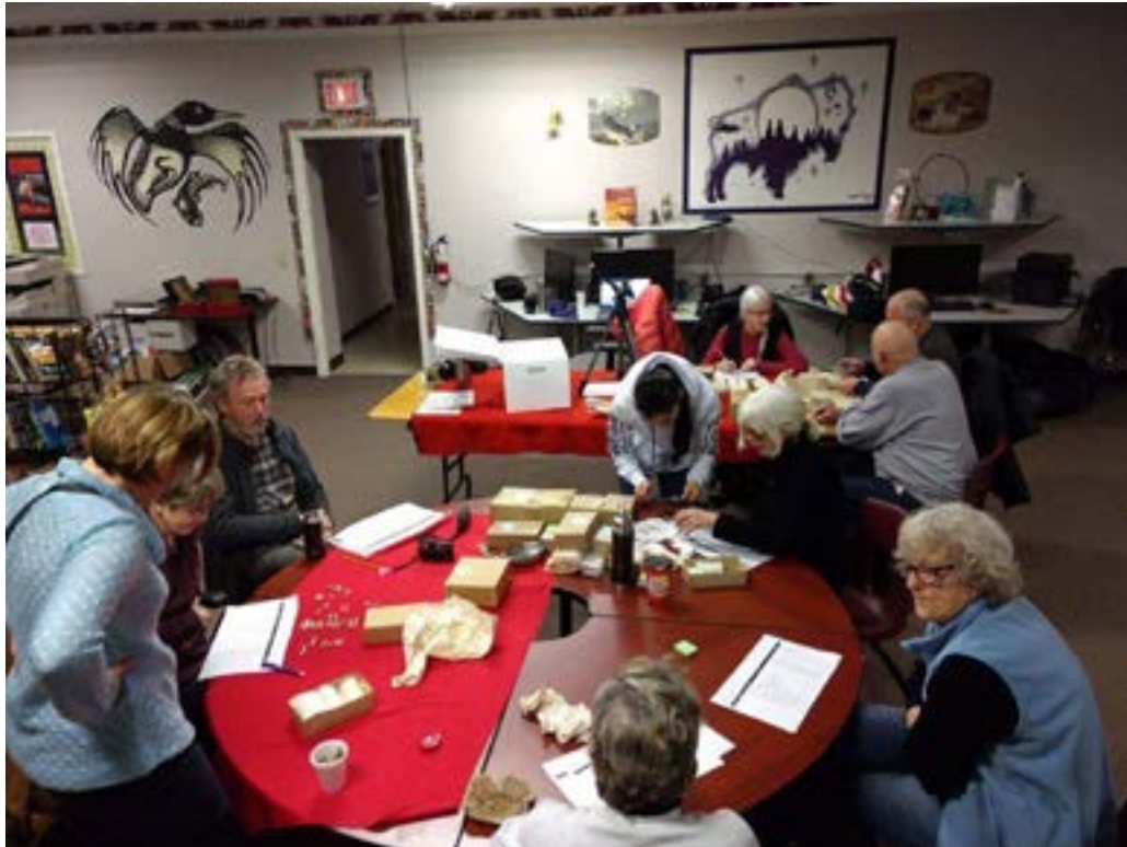
Volunteers at MFN Library “box day”

Without the collaborative support and direction of this group, we would continue to feel somewhat overwhelmed by the task handed to us. “Box” days begin with a traditional smudge. Red blankets and cloth cover the work tables that receive the artifacts we are engaging with for the first time. As we open each box, we are ensuring that everything remains associated with the packaging and the box in which it came. Photos are being taken of everything. All items are being inventoried and inserted into an excel spreadsheet we created. The accuracy of the catalogue will be extremely important for future reference and potential research on this unique collection.