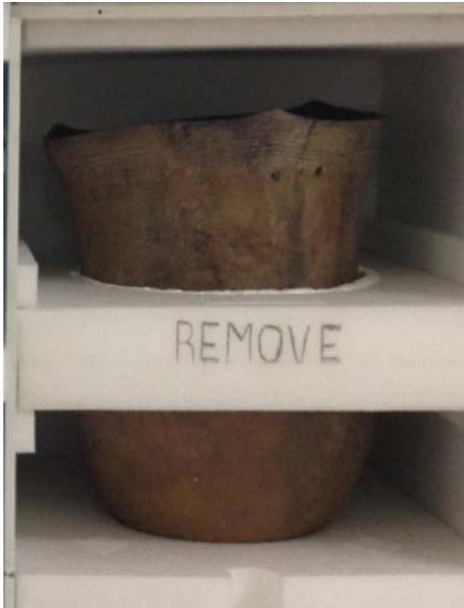
Reassembled Michipicoten pot at Canadian Museum of History, 2016

The return of the Michipicoten artifacts is just the start of a journey the community is ready to take.