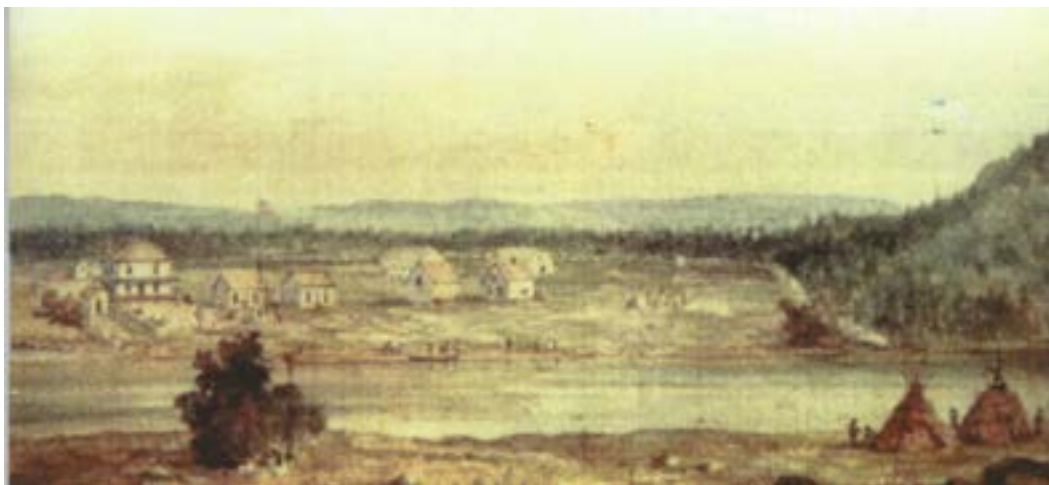
William Armstrong, HBC Post

Early landscape artist William Armstrong left behind some detailed watercolours depicting life at the Michipicoten Hudson's Bay Company post and the immediate vicinity in the 1880s and early 1900s. These early "snapshots" include images of indigenous shelters and daily activity along the river.